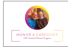
BALLOT BOX NOMINATION FOLD-OVER CARD 6" x 4", tri-fold, two-sided Smartworks # REC-0003-OSF