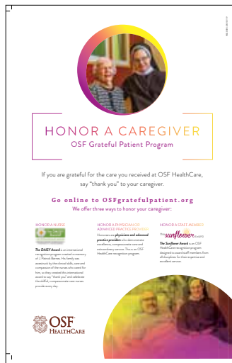
PROGRAM POSTER 11" x 17" Smartworks # REC-0005-OSF

Order through Marketing portal, cost will vary, approx. $200