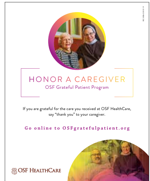
PROGRAM FOAM CORE POSTER 24" x 30" Smartworks # REC-0006-OSF