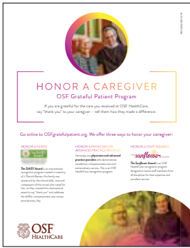
PROGRAM FLYER 8.5" x 11", laminating optional Smartworks # REC-0002-OSF