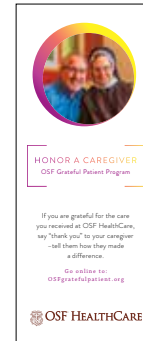
PROGRAM RACK CARD 3.5" x 8.5", two-sided card Smartworks # REC-0004-OSF