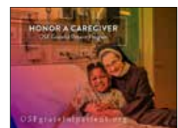
GRATEFUL PATIENT PROGRAM SCREENSAVERS Marketing & Communications will regularly promote as needed.